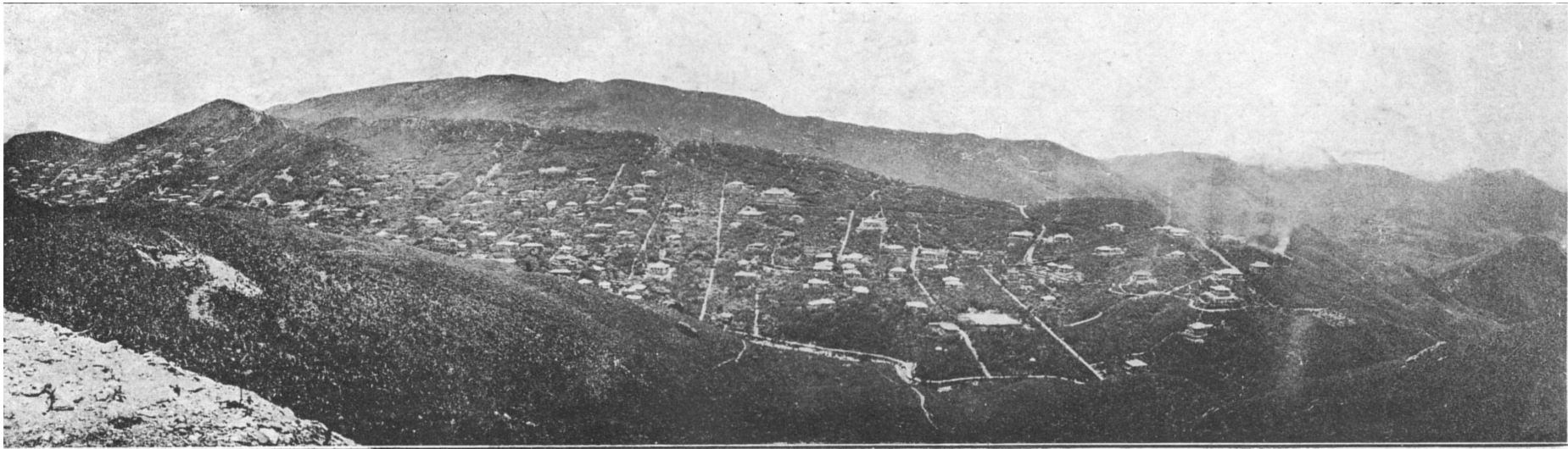
VIEW OF THE KULING ESTATE FROM CENTRAL VALLEY RIDGE.