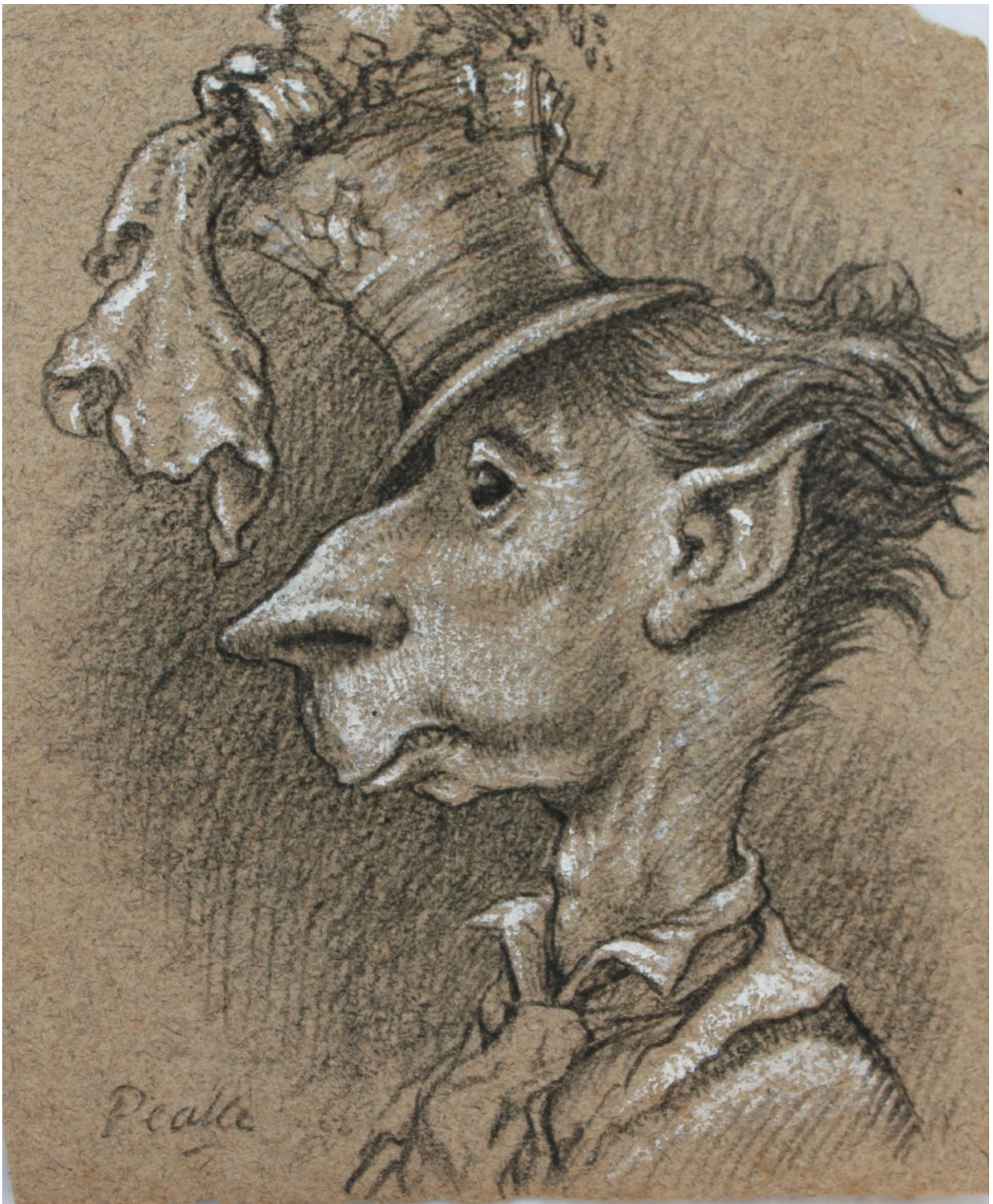
I love the Hatter who is here preparing to appear as Hatta in Through the Looking-Glass .